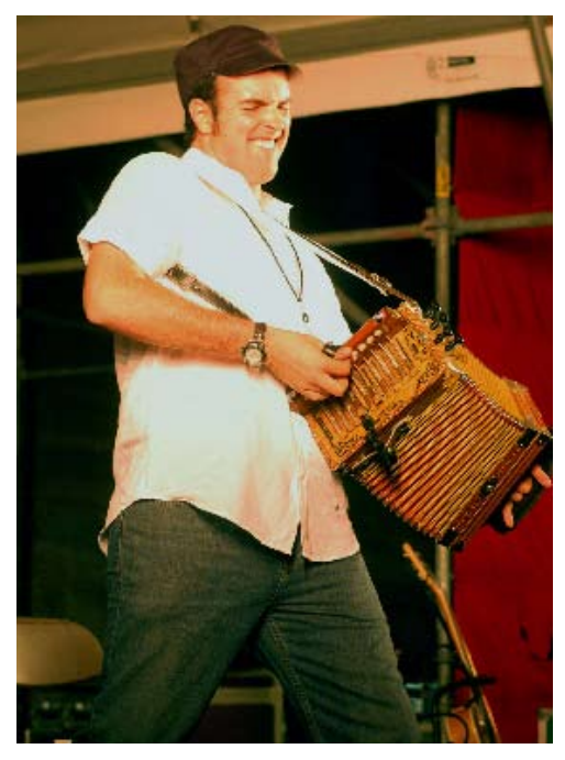
The Pine Leaf Boys